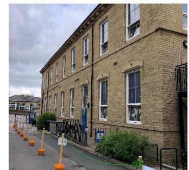
The Aire Building

When arriving via the main gate, the smaller building to the left is The Salt Building and the larger building to the right is The Aire Building . Key Stage 1 children are based in The Salt Building.