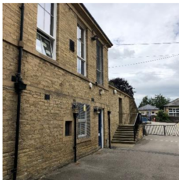
The Salt Building

Donaldson and Rosen Classes will begin school on Monday 6th September