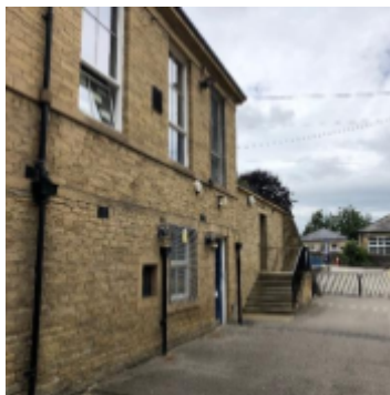
The Salt Building