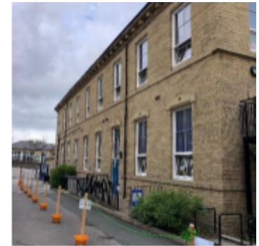
The Aire Building

When arriving via the main gate, the smaller building to the left is The Salt Building and the larger building to the right is The Aire Building . Key Stage 2 children, including Year 3, are based in The Aire Building.