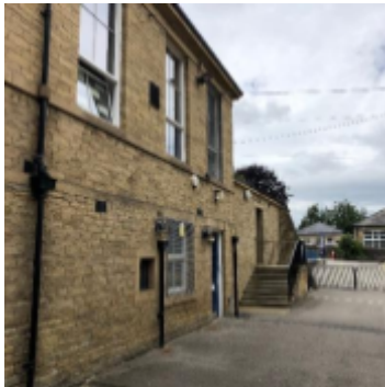
The Salt Building