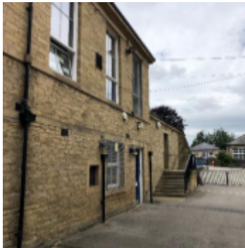
The Salt Building